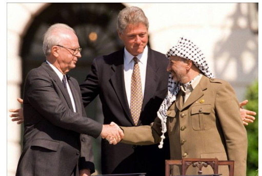
President Bill Clinton (center) with Palestinian leader Yasir Arafat (right) and Israeli leader Ehud Barak (left)

The normal position of the United States has been to attempt to negotiate a cease-fire agreement between both sides that may at some point grow into a full resolution of what land belongs to what group. While normally attempting to be neutral in these discussions, the US government has taken both sides. In 2017, the United States government announced that it was officially going to be moving its embassy from Tel Aviv to Jerusalem. This move, which was condemned in the General Assembly of the United Nations, showed strong support for Israel’s claim to control all of Jerusalem.