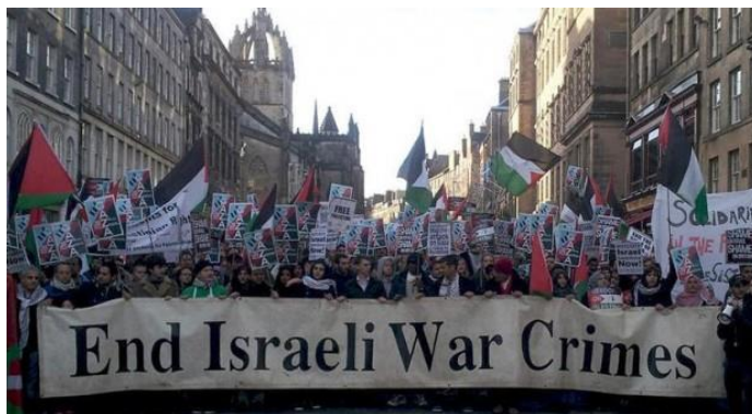
Palestinian groups believe that Israel is guilty of human rights violations.

Several wars have been fought in Israel since its creation, between Israel and the surrounding countries. Israel, historically with the United States' support, has been successful in all of the conflicts. In many of the conflicts, they have been forced to give land back to the people they have taken it from by the United Nations. Israel also represents the most religiously and politically tolerant nation in the Middle Eastern region, making it a natural ally of the Western nations. The Palestinians, who were rejected by surrounding nations as well, were largely left in resettlement camps in undesirable parts of Palestine.