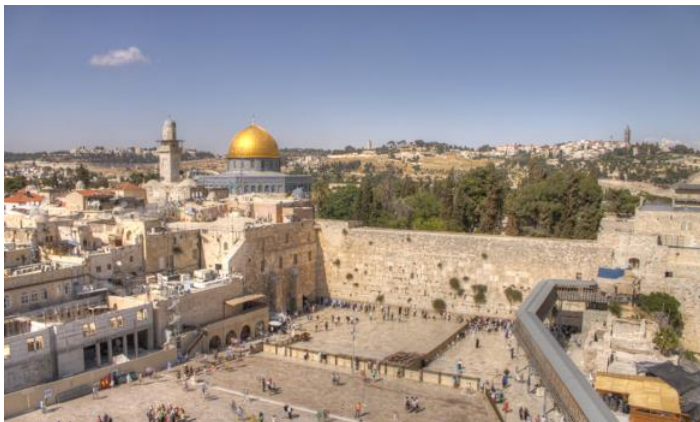
The Western Wall or "Wailing Wall" is all that remains of the Jewish Temple complex of Jerusalem. The Dome of the Rock, a holy Muslim site, is seen in the background, directly on top of the location of the old Jewish Temple.

Jerusalem was the capital city of Israel during the time of Jesus and had been the Jewish capital city for over 1000 years. In 70 AD, Israel ceased to exist as a nation when the Roman Empire crushed a Jewish revolt and destroyed Jerusalem and their temple, sending the Jews throughout the world. Since Jerusalem was the capital of Israel, the main Jewish Temple had been built in the city, although it was also destroyed by the Romans.